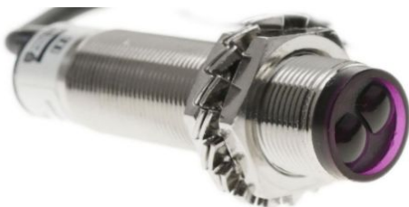
Photo-Electric Object Sensor