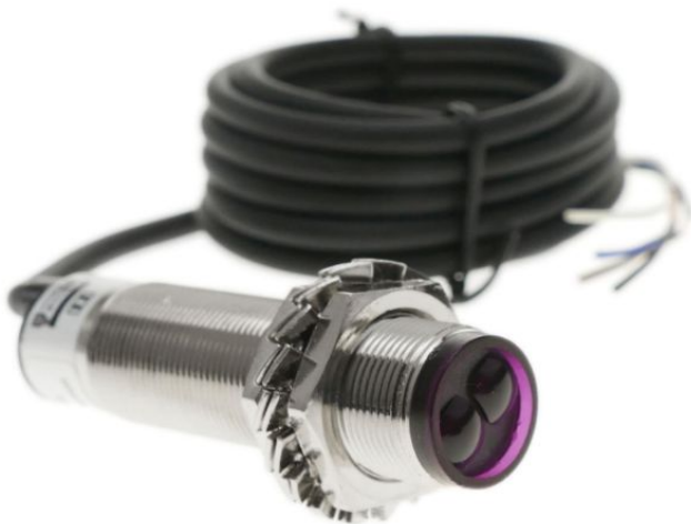
Photo-electric sensors fitted within the lift shaft detect when the car is in its normal position. An indicator / warning panel shows users the cars position status.

Power is taken from the ship's mains supply – 100-240V AC 50/60Hz